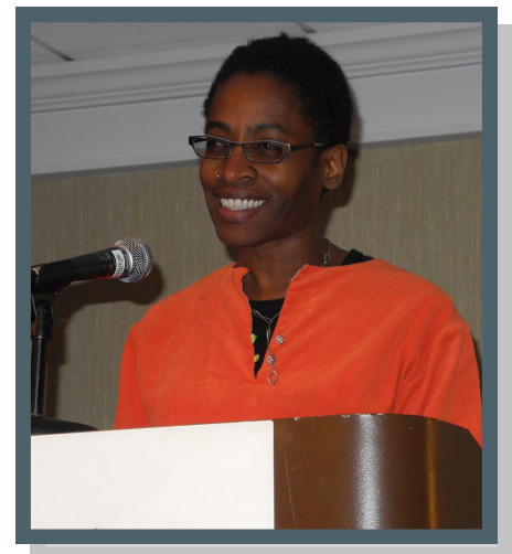
Above: Jaqueline Woodson performs a reading of her award-winning book, Show Way